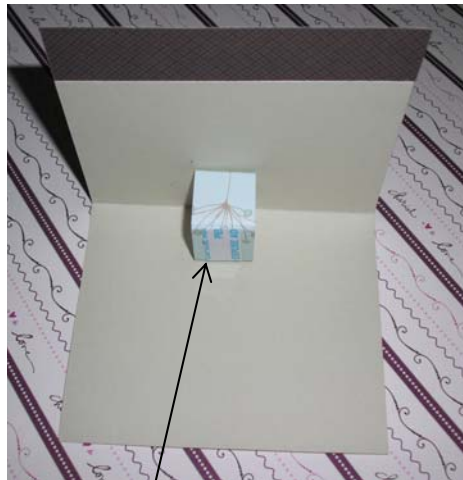
attach Christmas Tree here